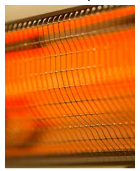
reduce inventories, while offering their customers even greater choice, functionality and performance.

The Pro-16 is a standard 1/16 DIN size, measuring just 48x48x118mm, making it easy to incorporate into machine units. Just as importantly, it offers a unique combination of features, ease of use and programming options, helping manufacturers of industrial and automotive heater systems